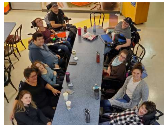
Coffee Time During A!TLC