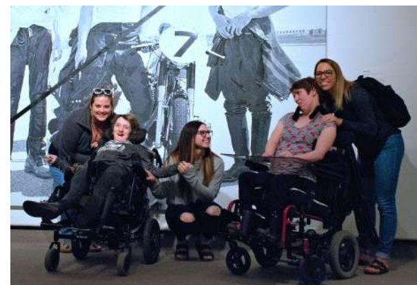
MacKenzie Art Gallery