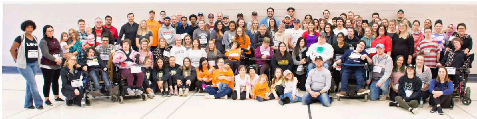
5th Annual Walk and Roll