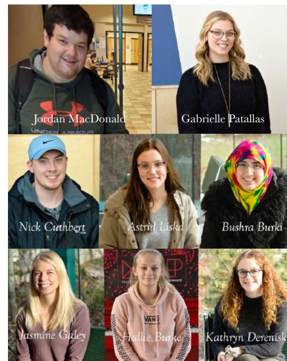
Placement Students & Volunteers

Thank you to our 2019-2020 program volunteers and placement students!