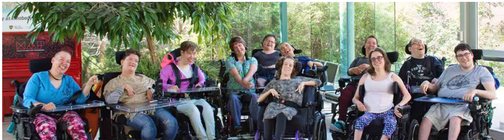
2019 Summer Literacy

For additional support, we hired two summer students to assist with program development, implementation, and evaluation. We are pleased to be offering the program again in summer 2020, virtually.