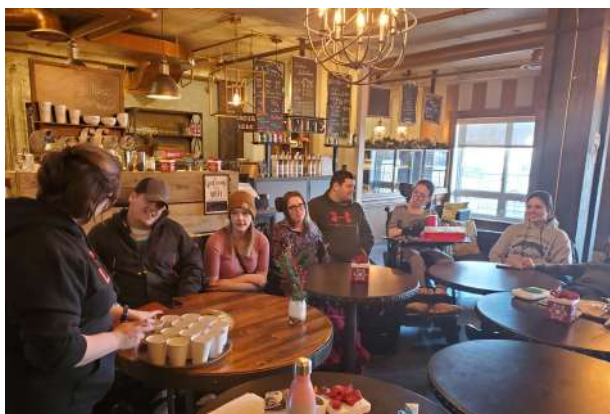
The Art of Coffee