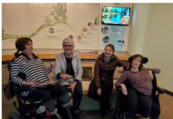
Royal Saskatchewan Museum