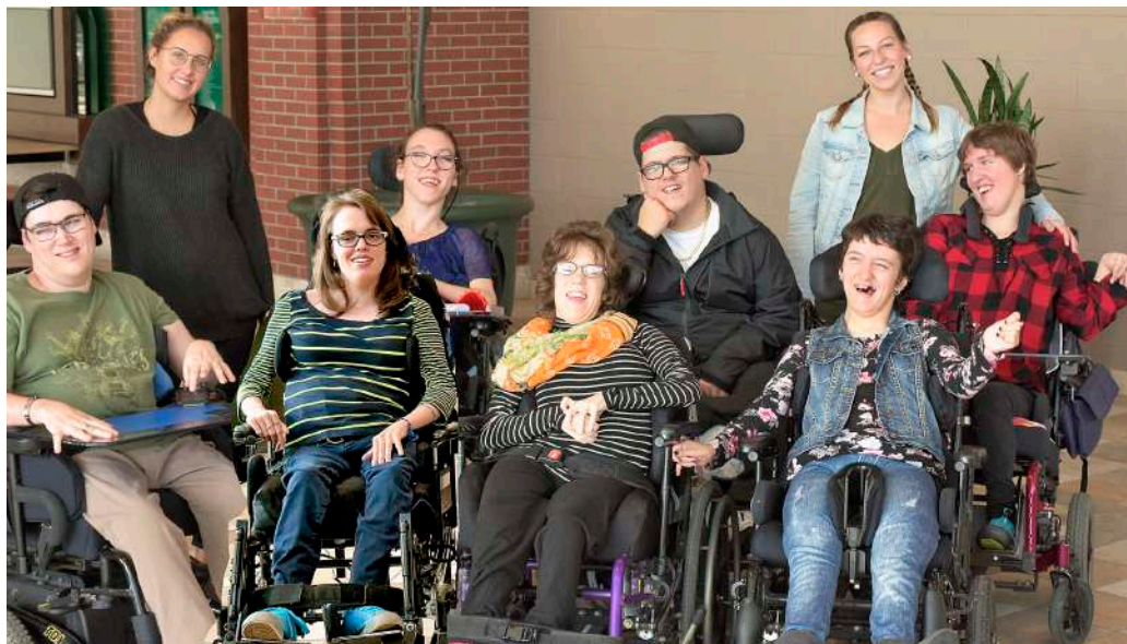
2019-2020 A!TLC Student Researchers

A!TLC is a place where Core Members become Student Researchers. Established in January of 2013, A!TLC provides unique opportunities designed around each individual's particular strengths, dreams, and needs. Astonished! staff, volunteers, and placement students support each Student Researcher as they determine and navigate a program PATH or areas of interest unique to them. Additional program content is designed around common areas of interest. Further, Student Researchers are leaders and work with the University Community in research and teaching about disAbility and inclusion.